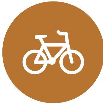
Paths/Safe Options for Biking and Walking 3.34