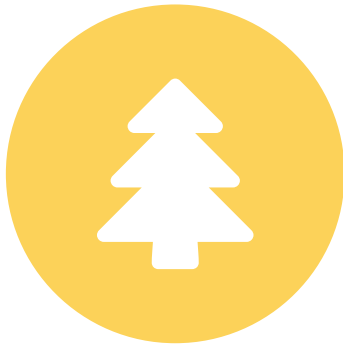
Parks and Recreation Facilities 4.05

Average ratings on a scale from 1 (very poor) to 5 (very good):