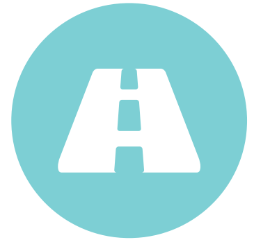
Road Maintenance 3.27